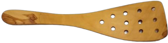
SGLP032/12h - Large Curved Spatula with holes 32 cm 12 holes Handle hole : 0 / 4 / 7 / 10 mm