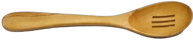
CSLS30 - Slotted Spoon 30 cm 3 slots Handle hole : 0 / 4 / 7 / 10 mm