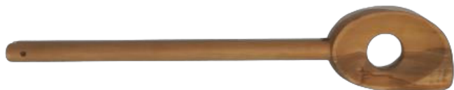
M030/1p/h - Spoon Mouvette 1 pointe with hole 30 cm Unique hole 25 mm Handle hole : 0 / 4 / 7 mm