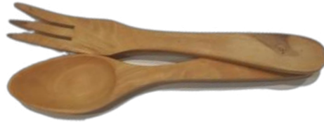
CC021 – Parisian Curved 21 cm Handle hole : 0 / 4 / 7 / 10 mm