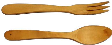
CC030 – Parisian Curved 30 cm Handle hole : 0 / 4 / 7 / 10 mm