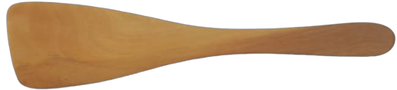
SG030 - Curved Spatula 30 cm Handle hole : 0 / 4 / 7 / 10 mm