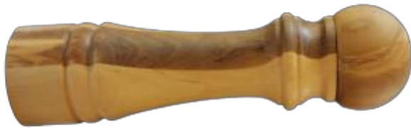
M/Tradi20 - Traditional 20 cm Body : Light Olive Wood Mechanism : Ceramic, adjustable